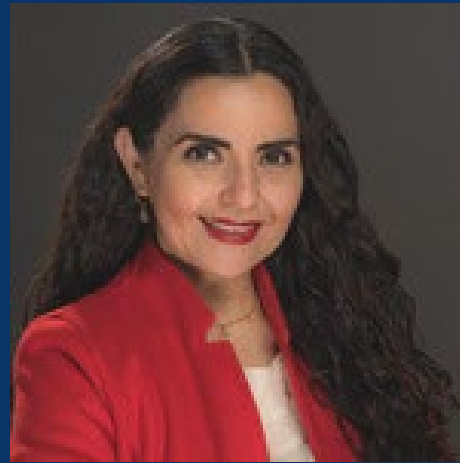
Mayor Ali Saleh